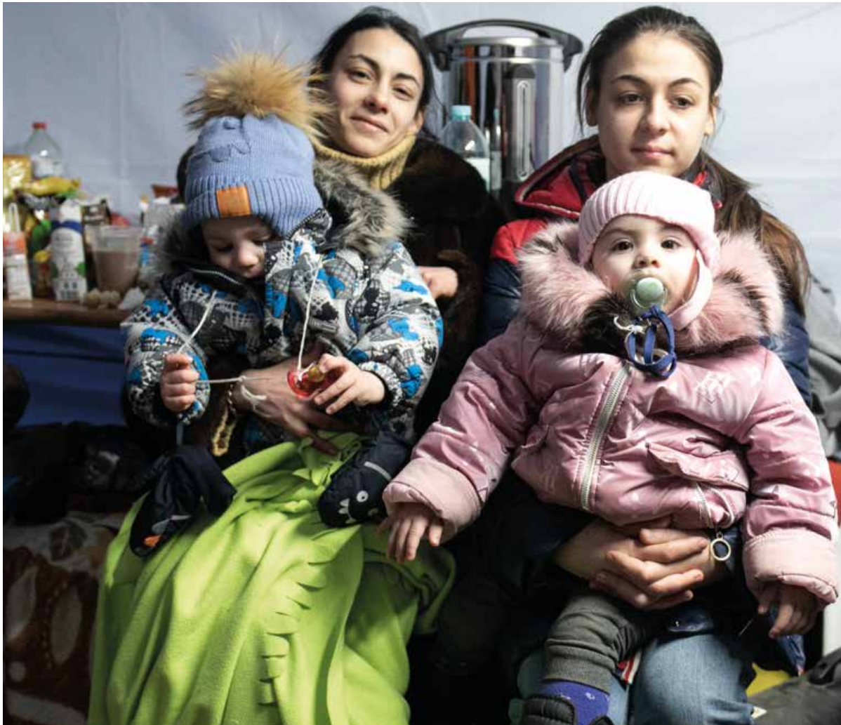
Alina* (named changed), aged 27, refugee with two young children (ActionAid UK).