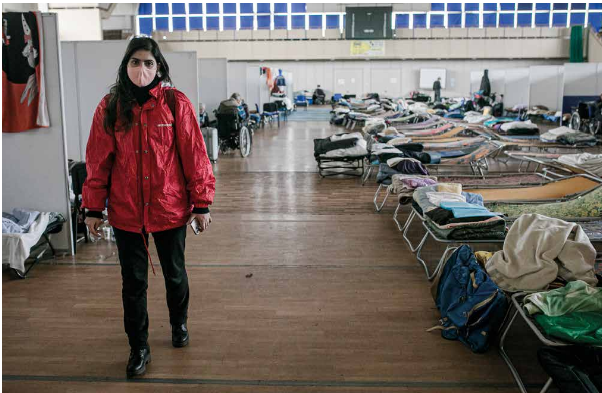
ActionAid Staff pictured at sports and recreation center in Chelm, Poland being used as a reception centre (Simona Supino/ActionAid).

This loss in livelihoods, combined with increased rent, energy, and electricity prices in Ukraine and unequal access to finance, resources, and services, is making more difficult for women to access safe and dignified accommodation. Within Ukraine, around two thirds of the population displaced by the war live with relatives, friends, or in rented housing. 61 Ukraine’s neighbouring countries have hosted the people escaping the war in Ukraine through a combination of government-run and privately-run shelters and individual private homes offered by citizens of the host country. 62 Temporary accommodation run by private providers and strangers do not always provide a dignified space for living, have much more limited services and assistance – such as psychosocial support, registration, medical support, and case management - and increase the protection risks for women and girls when they rely on unvetted individuals.