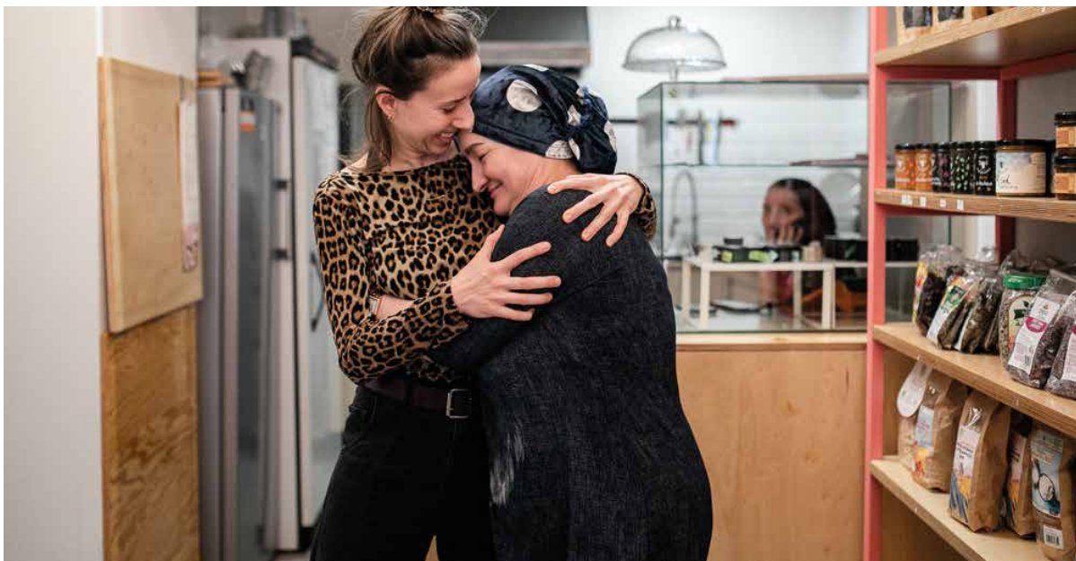
Founder and members of Kuchnia Konfliktu (Conflict Kitchen): a social initiative which aims to support refugees and migrants within Poland to find work by offering fair terms of employment and training, while also working to break down stereotypes.