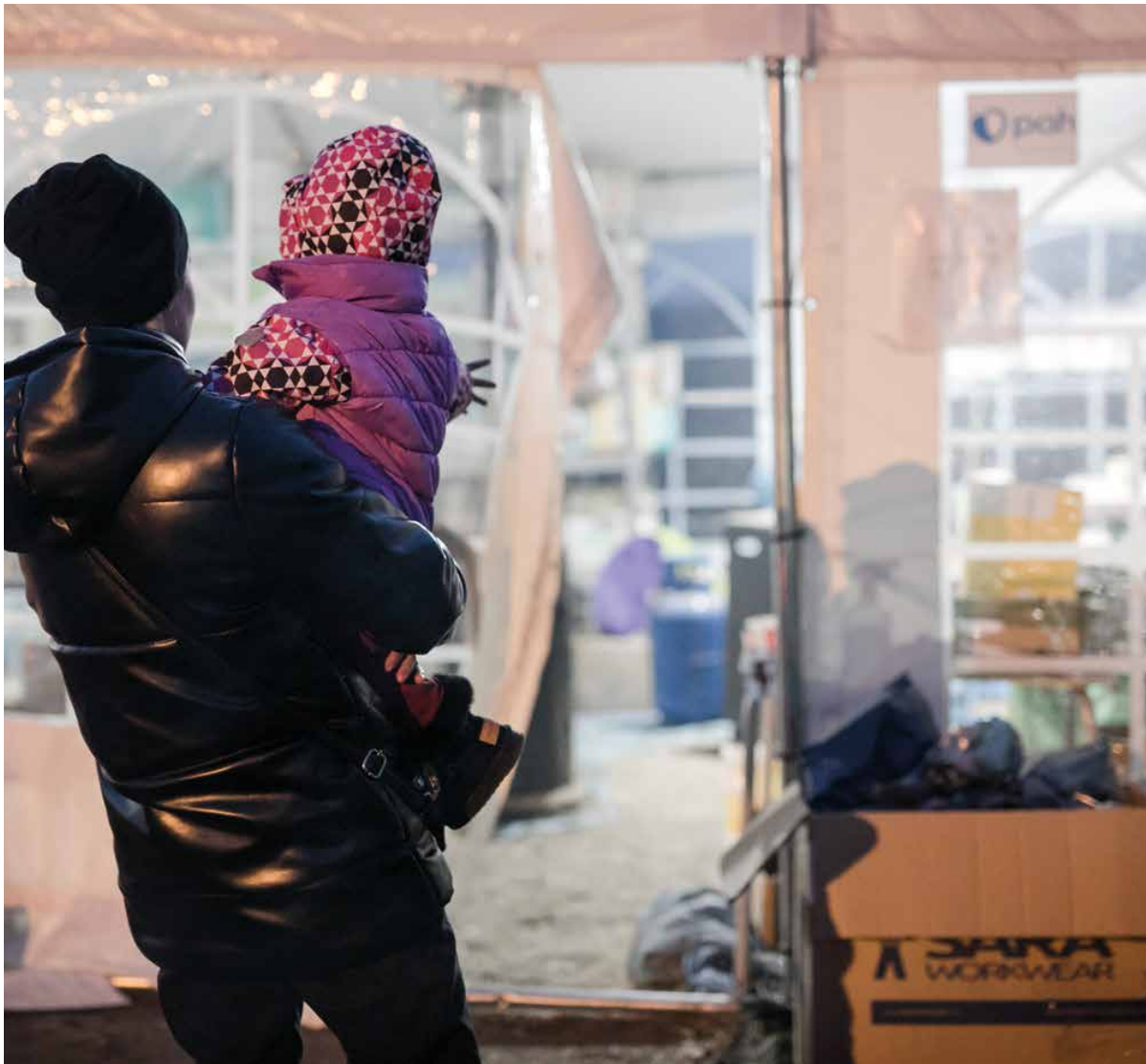
Refugees fleeing the war in Ukraine, at a Polish-Ukrainian border where ActionAid partner PAH (Polish Humanitarian Action) was operating.

Each section presents first the context, and then the main challenges that partners are facing, followed by specific examples of their adaptive and responsive strategies. All three topics are interconnected, and bring to the forefront the importance of holding equitable partnerships and funding streams. The final section describes overarching recommendations in these three areas.