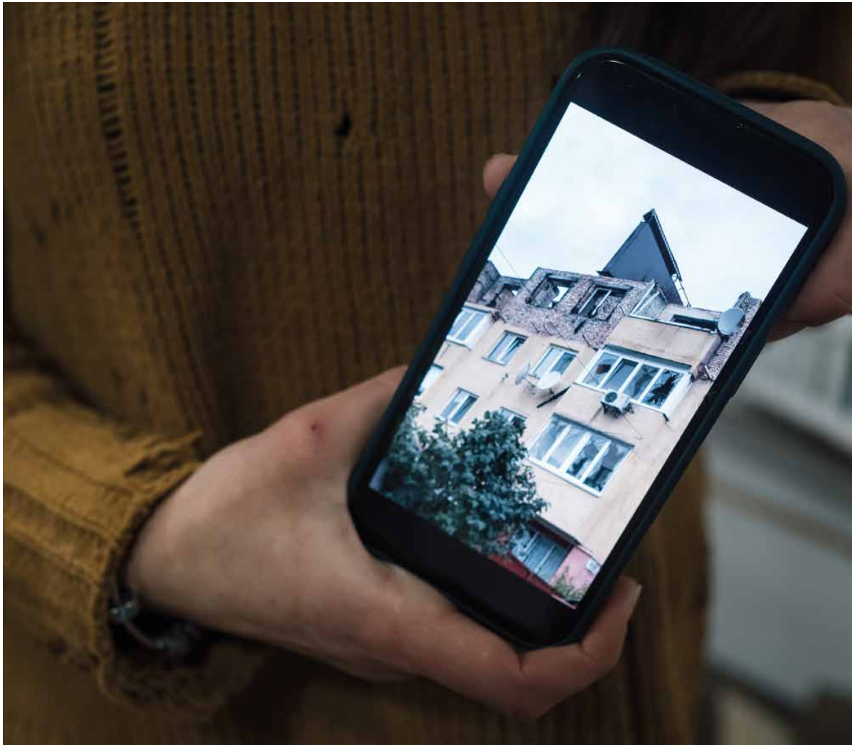
Natalia, a volunteer at Insight NGO, shows a video with her destroyed apartment on the top floor of the building in Irpin (Anastasia Vlasova/ActionAid).