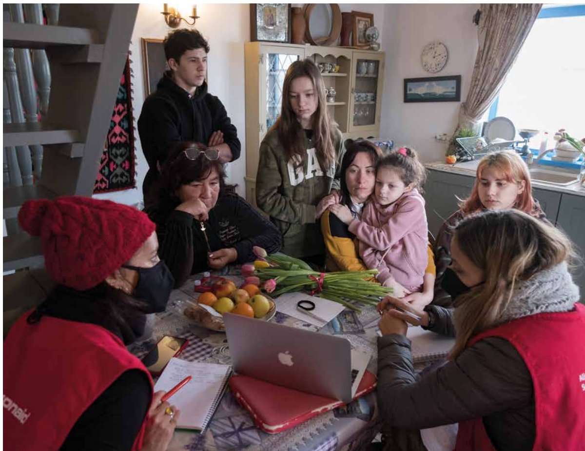
Ukrainian Refugee Family who fled the war as their city was under threat of being bombed speaking to ActionAid staff. They took four buses, a ferry and crossed from Isaccea, the southernmost border of the Romanian-Ukrainian border.

Analysing converging axes of oppression that compound vulnerability for women of diverse backgrounds (e.g race, class, disability, SOGI) and applying this information to ensure effective targeting and accessible services and support.