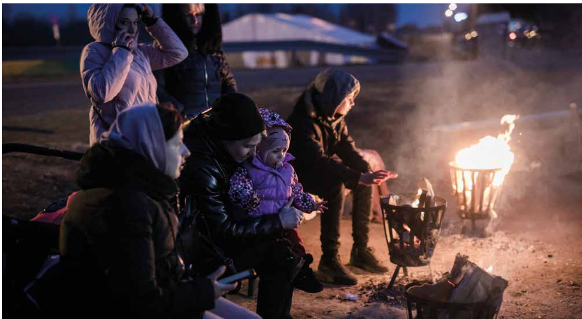
Zosin crossing point on the Polish Ukraine border Where ActionAid partners PAH (Polish Humanitarian Action) are operating.

Despite these challenges, women, WROs and WLOs are at the frontline of caring responsibilities in households as well as leading national and local civil society organisations, emergency protection and assistance services. Their work aims to advance and defend gender equality and women’s rights, through WROs and WLOs, and young people-led organisations and initiatives. Their long-term mandates include addressing discrimination, providing sustainable and dignified livelihoods, and protecting women’s rights. This work is essential to upholding women’s rights while military priorities dominate Ukraine and the region. ActionAid and partner’s evidence and experience highlight that WROs and WLOs bring valuable skills and assets to localised humanitarian action. They are often able to gain access to hard-to-reach communities and those most marginalised within them, they bring a strong understanding of the local context and the needs and realities of women, girls and the community as a whole, and they