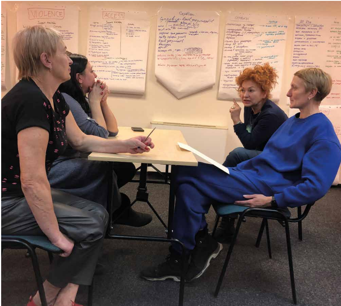
Legalife partner in Ukraine country at a research workshop with ActionAid, addressing key lessons learnt and challenges faced. This workshop took place in an underground shelter, amidst ongoing air strikes in Ukraine.