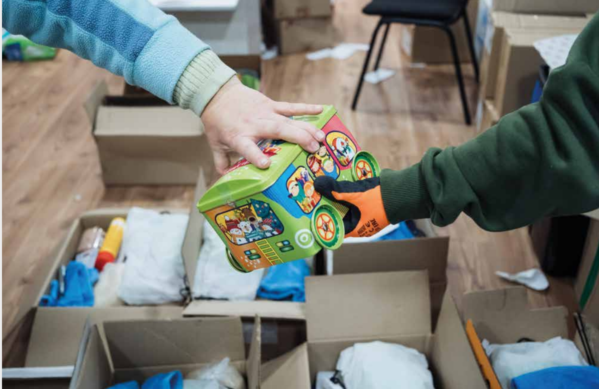
Children and women's dignity kit packages at Insight humanitarian Hub, Ukraine (Anastasia Vlasova/ActionAid).