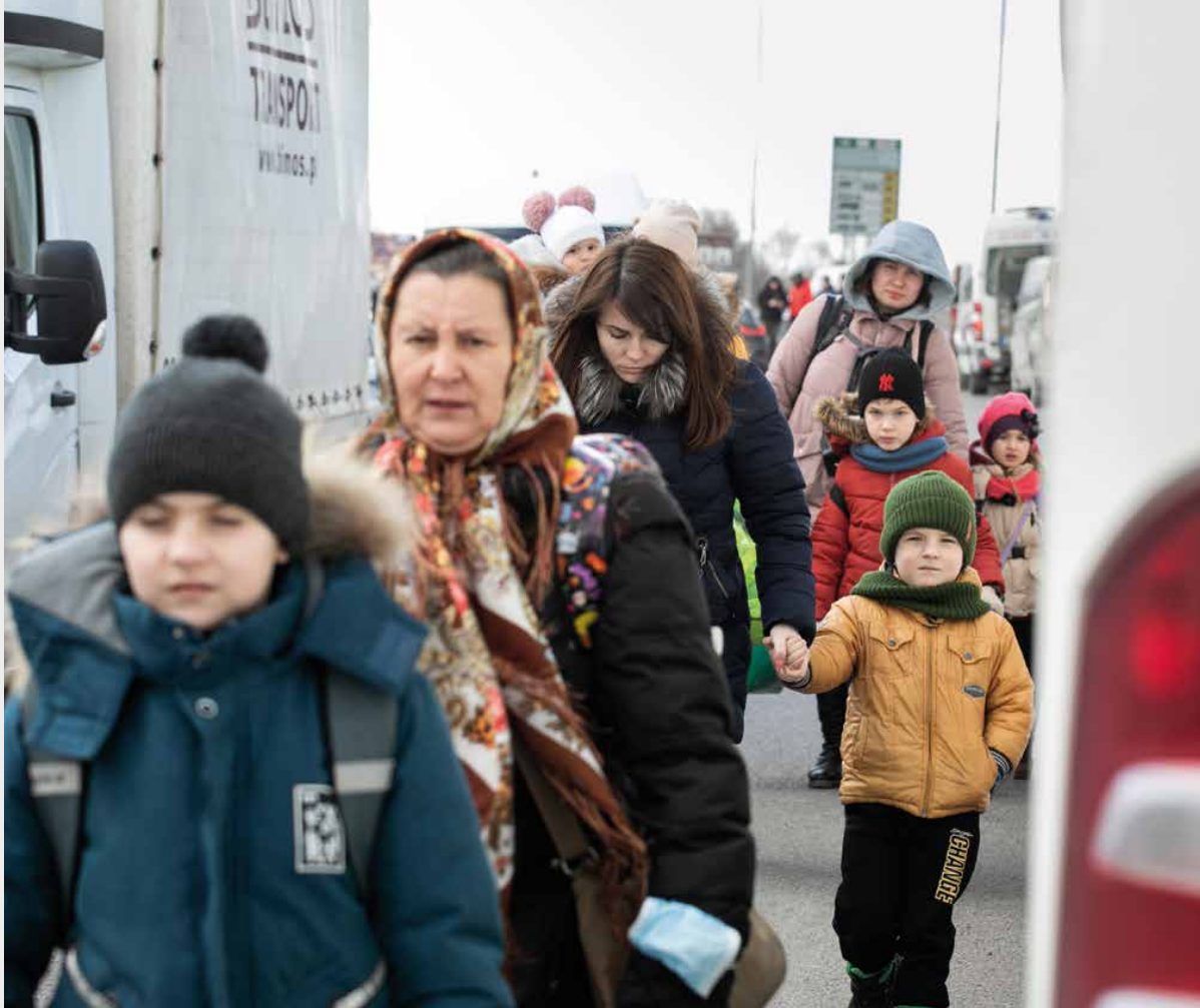
Displaced women and children arrive at Hrebenne, a crossing point on the Polish side of the Ukraine-Poland border where ActionAid and partner PAH were working.

Front cover image: Illustration by Fernanda Algorta showcasing different features and moments ActionAid and Partners have witnessed when working in the Ukraine Response